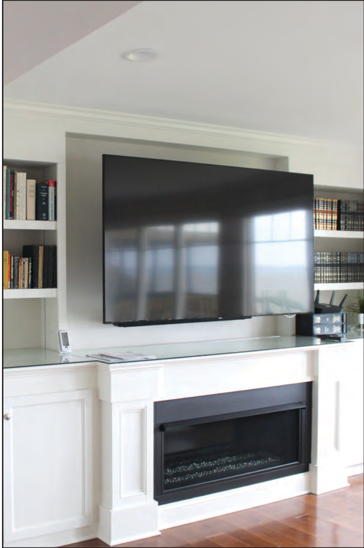
The television, fireplace and bookshelves make for a comfortable and cozy home.