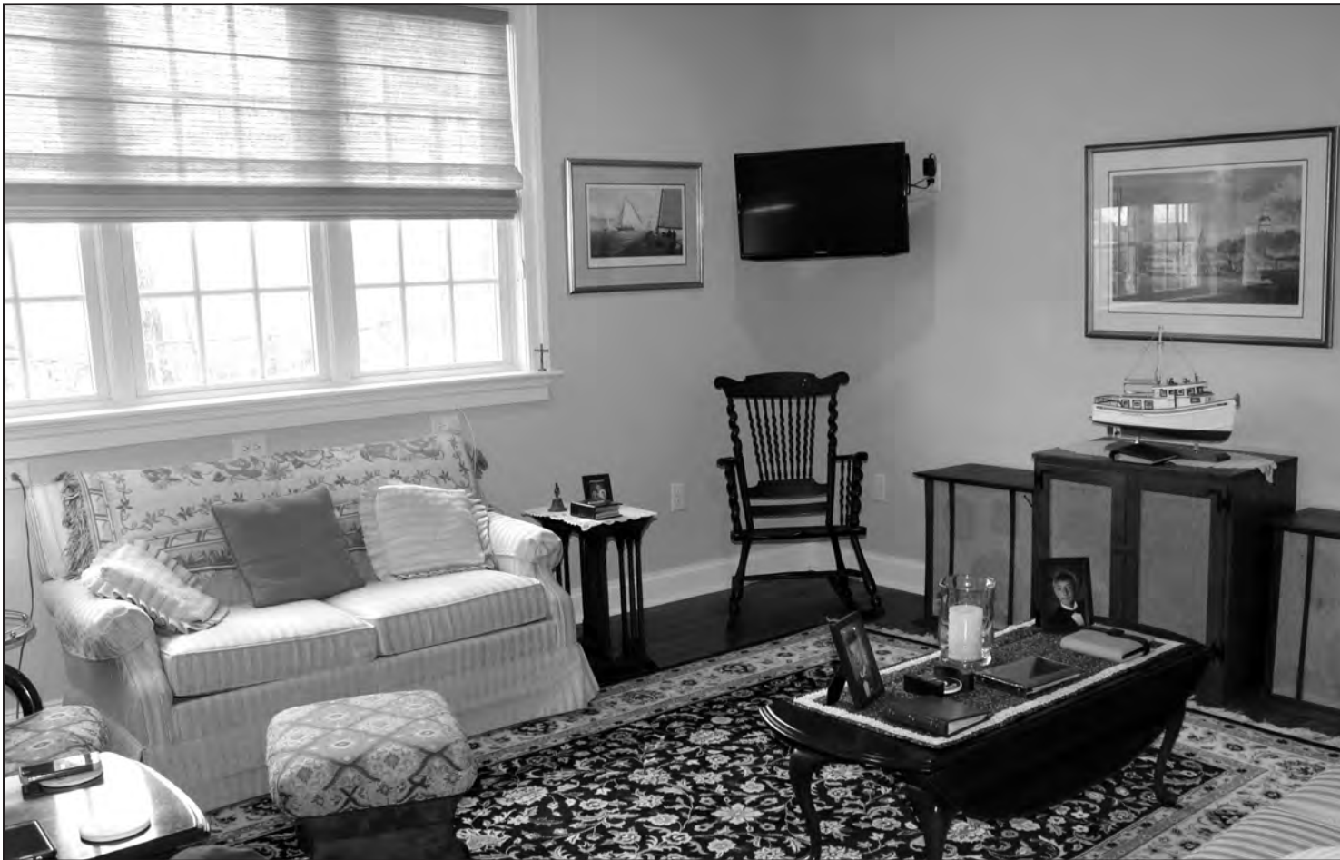
The great room at this Westville Landing home has lots of space for entertaining guests and enjoying family time.