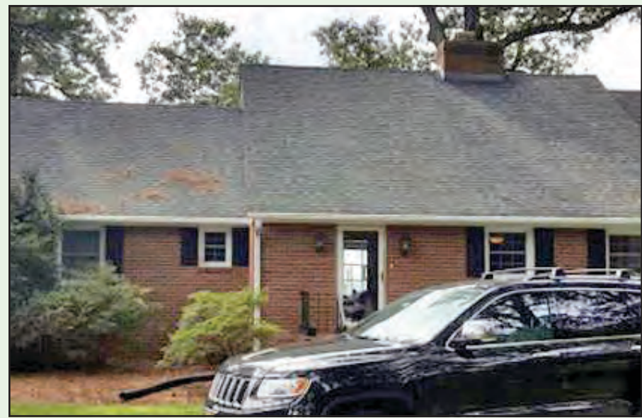
The front, above, and back of the house before renovations.