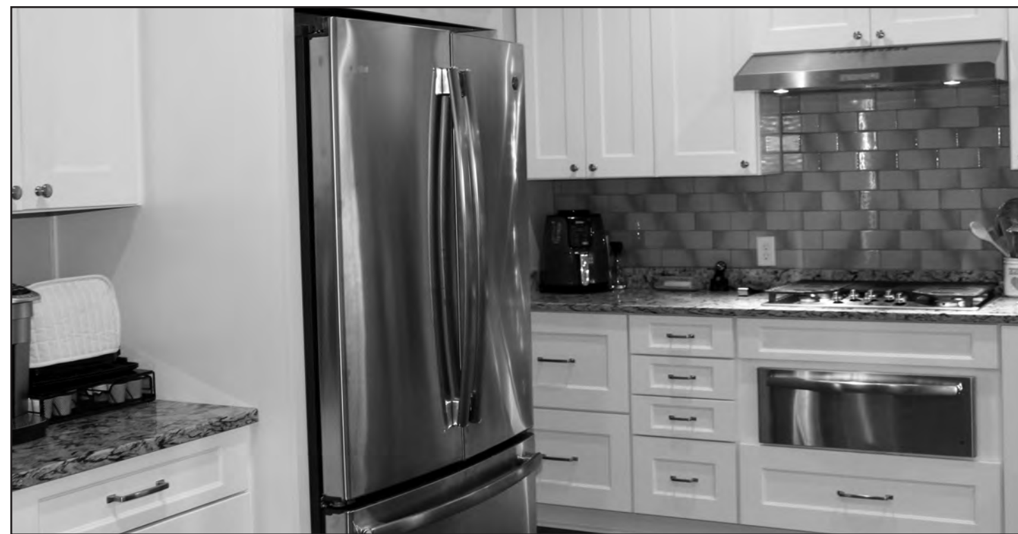
The kitchen has a lot of cabinet and fridge space.