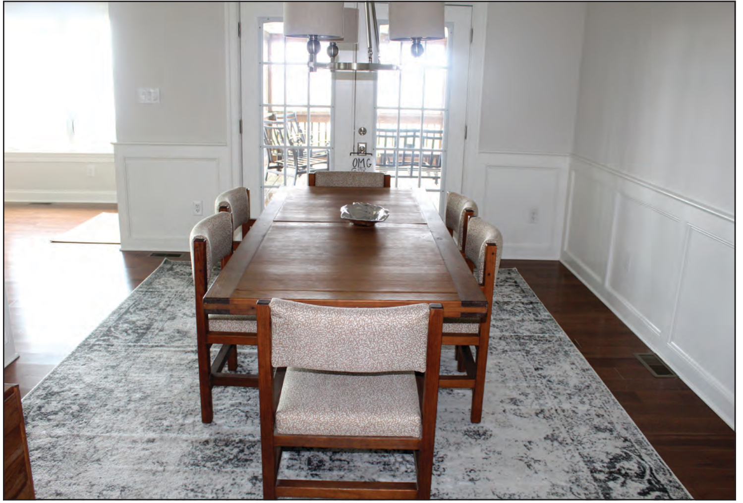
The dining area is connected to the kitchen and the living room.