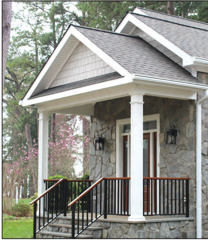
The renovated front entrance of the house.