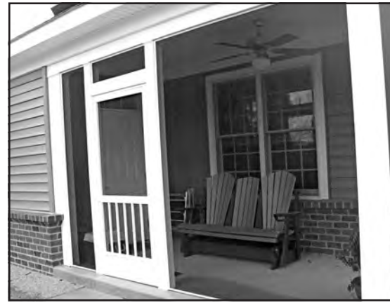
The screened-in porch is perfect for enjoying the outdoors at a distance.