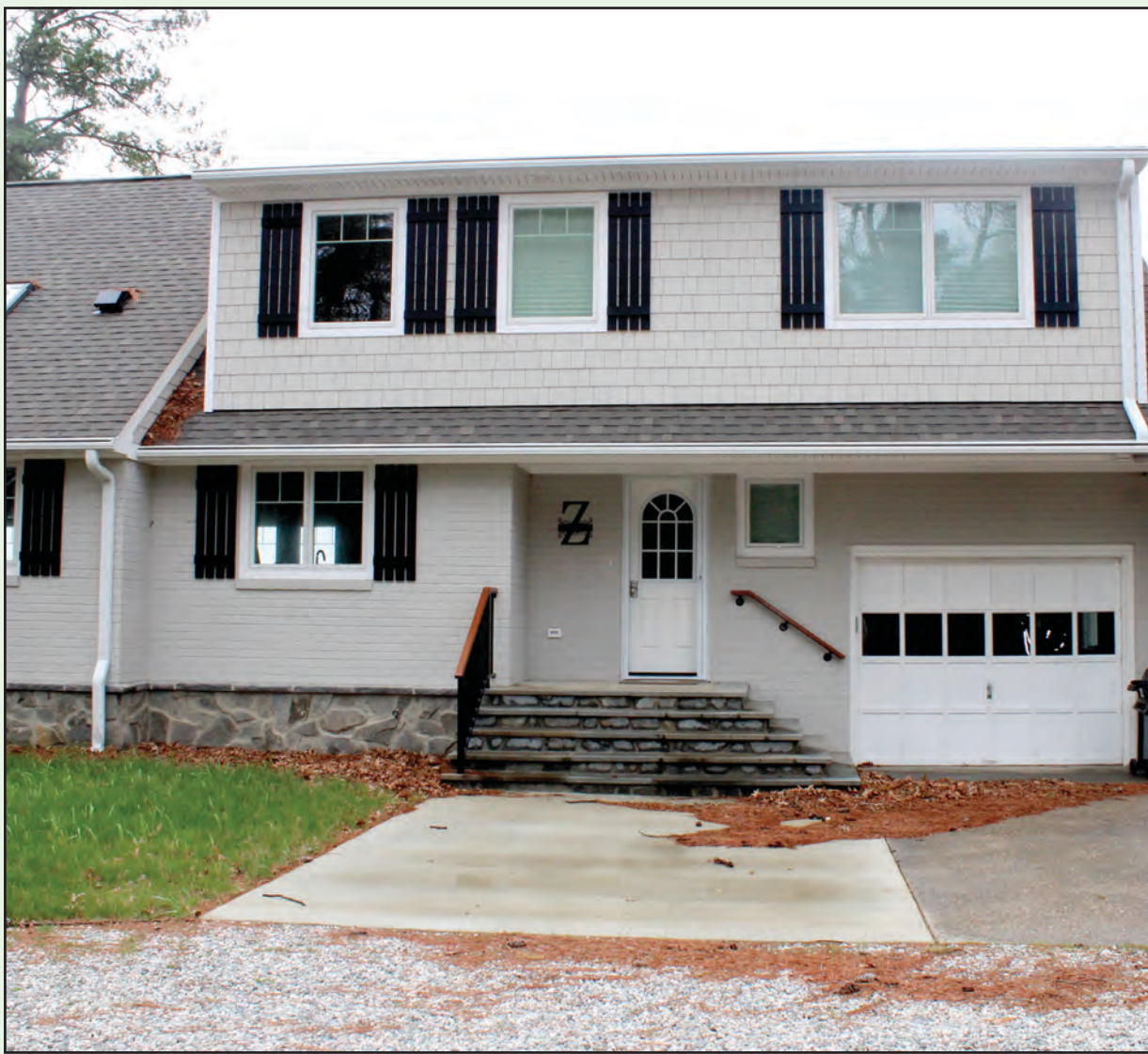
The renovated front of the Zielenski's home.