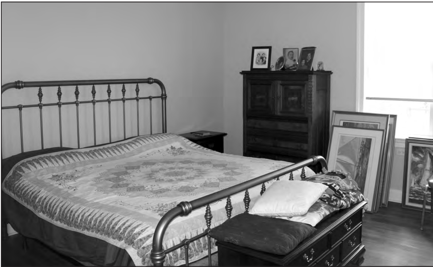
The master bedroom includes a walk-in closet and plenty of space.