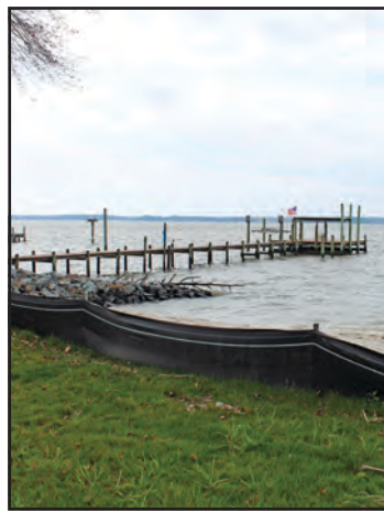
The balcony provides a scenic view of the York River.